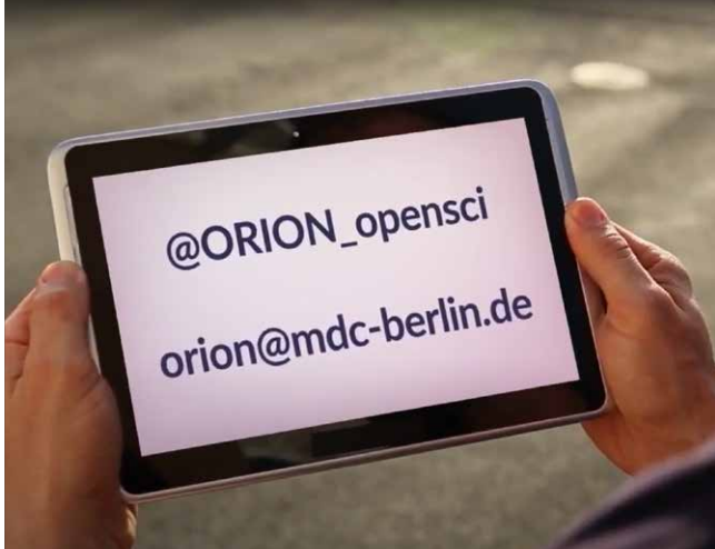
Course ORION MOOC for Open Science in the Life Sciences